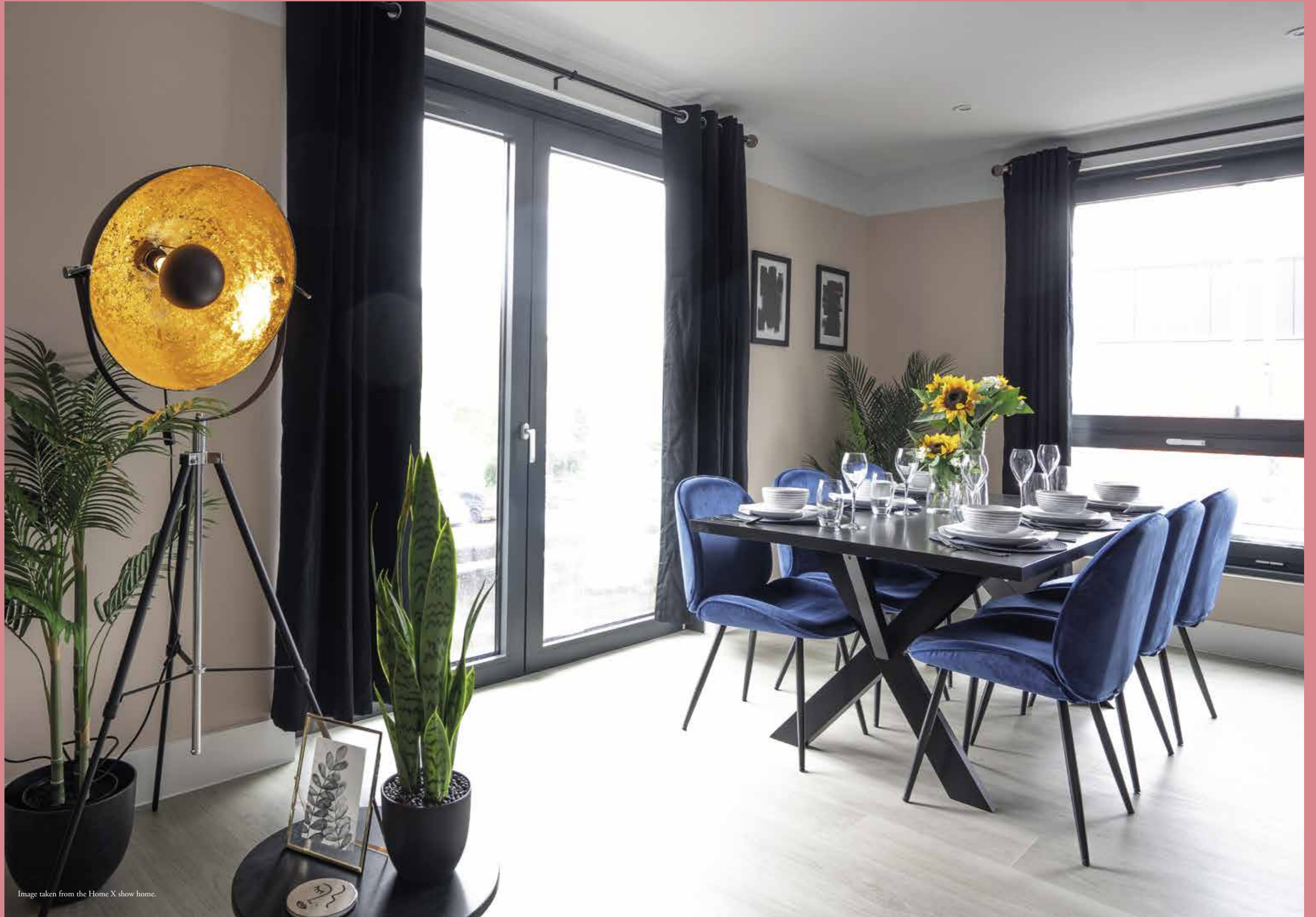
Image taken from the Home X show home.