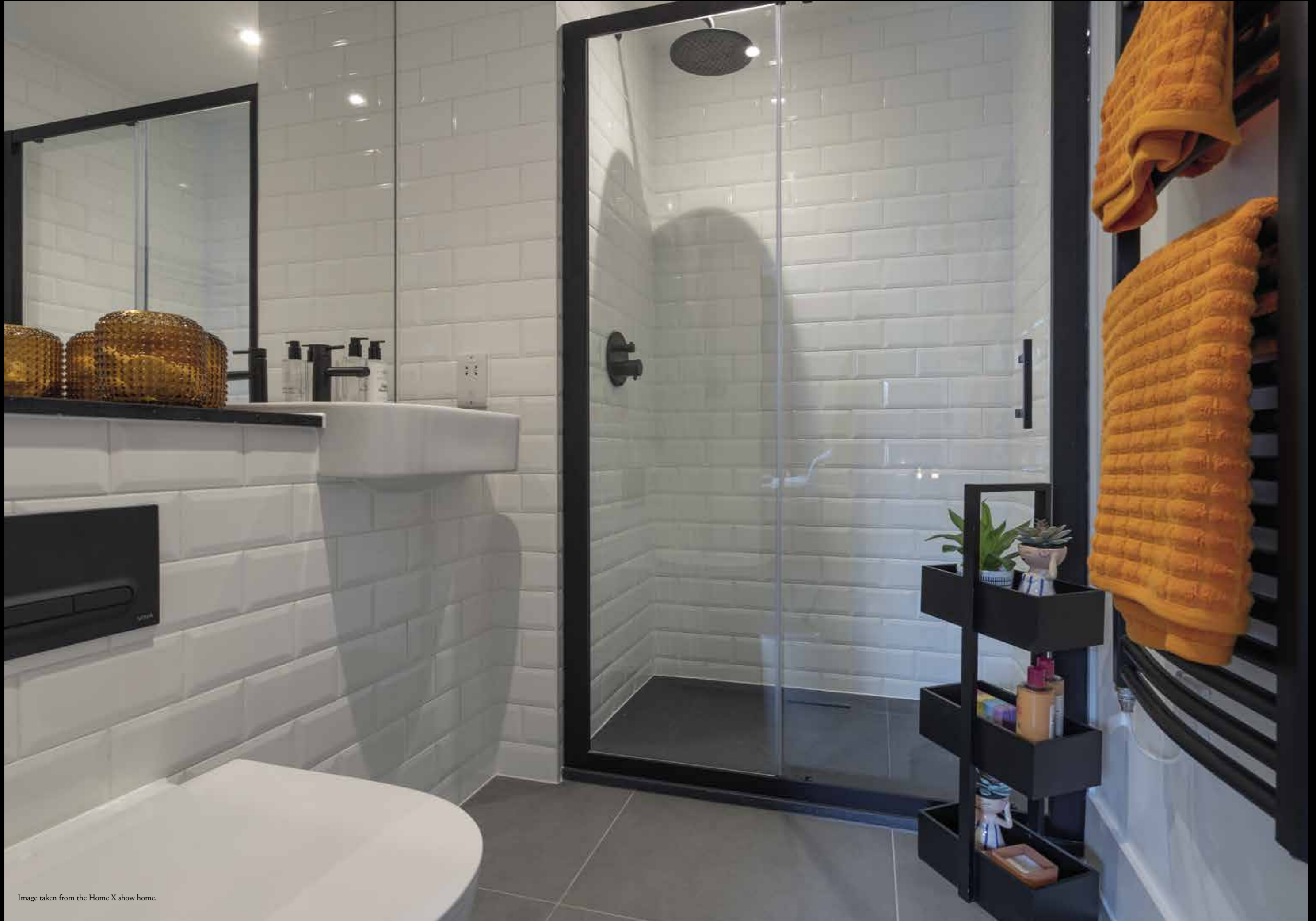
Image taken from the Home X show home.