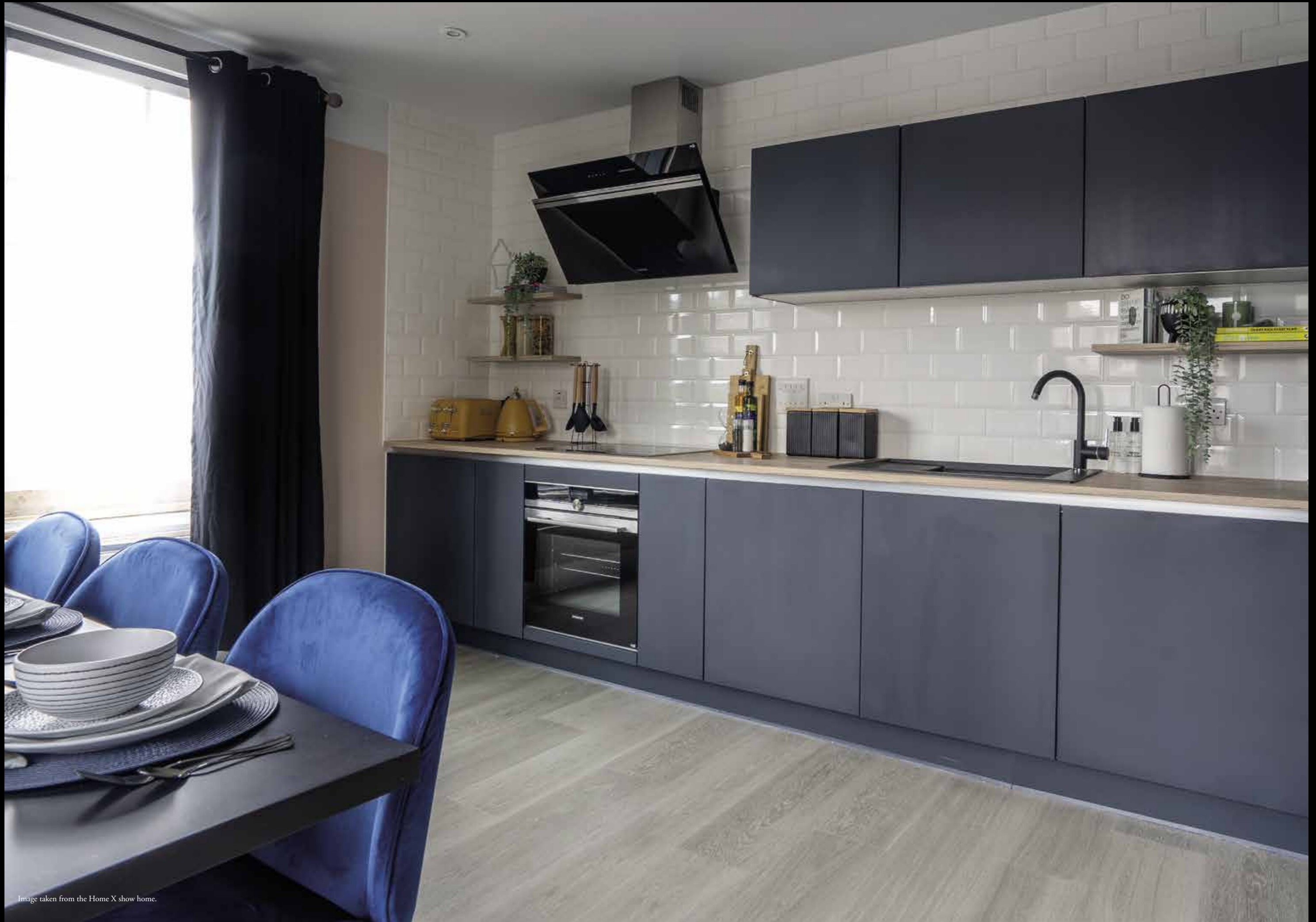
Image taken from the Home X show home.